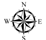
City of St. George, LA