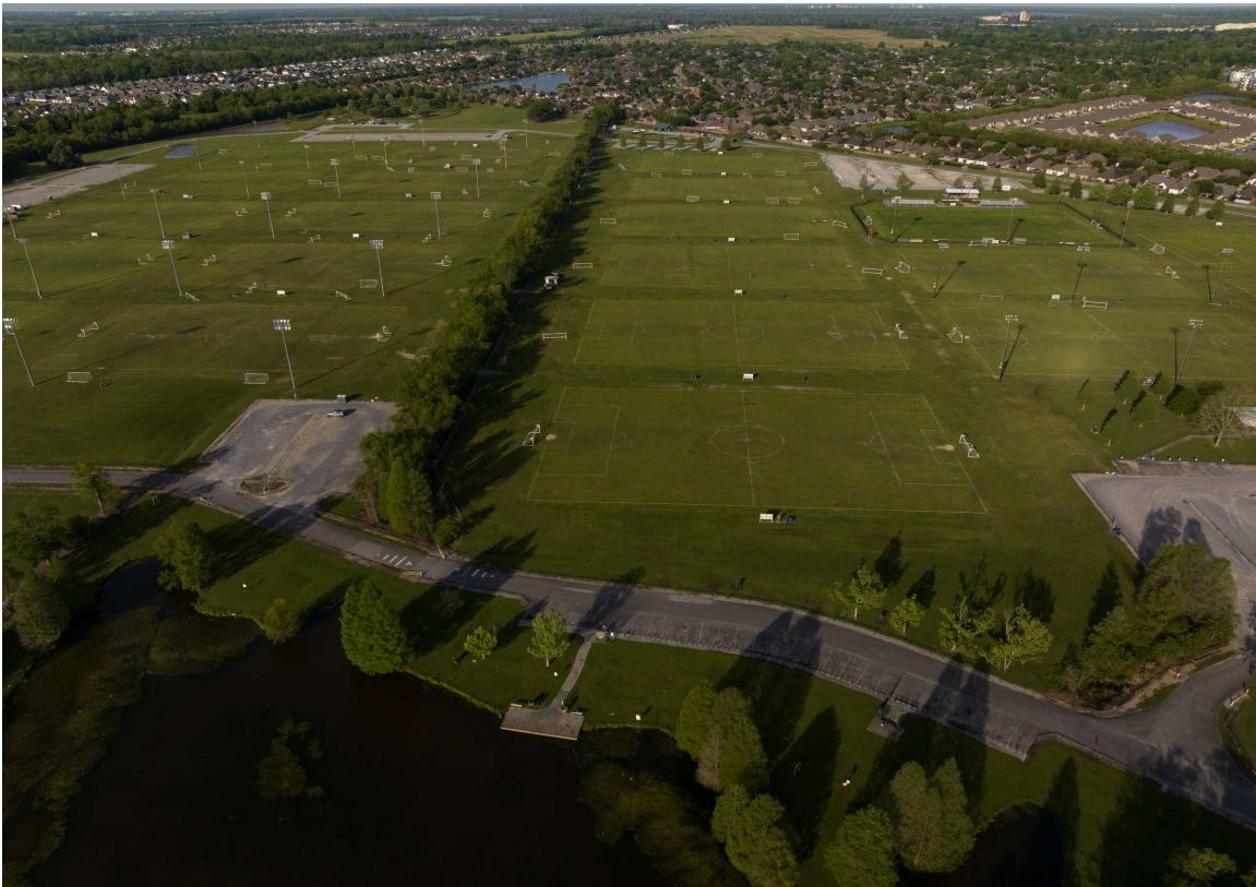
Installing the J-turn from the Burbank Soccer Complex will eliminate hazardous left-turn movements, increase driver visibility, and significantly reduce the risk of crashes.